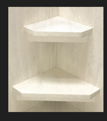
Individual 6" and 9" Diagonal Corner shelves pair nicely for a customizable caddy look.

The Mystera trim & Accessories allow maximum flexibility in creating a personalized space.