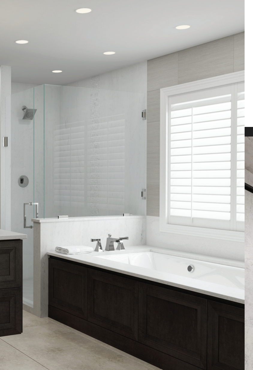
Image above shows a complete custom bathroom design utilizing Mystera Carrara MSB-927, including shower walls, vanity top, tub and deck, and cosmetics vanity. Matching vanity material coordinating colors with shower panels.

Shower base is a custom design utilizing Mystera White MSB-901