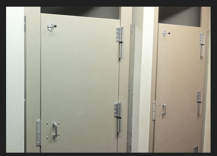
Image shows Mystera Fawn MSB-982 shower dressing rooms in a university dormatory.

Mystera vertical wall panels are the perfect solution for University housing, multi-family complexes, or Hospital rooms. Mystera ¼" solid surface panels create a clean and durable surface.